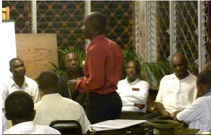
Testimonies of Gods power in Haiti