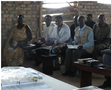
Discipleship training Mohorro, Uganda