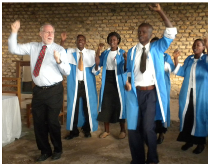
Worship in motion Ugandan style