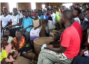
Remote church in Kurukuru, Uganda