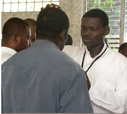
Anointing regional Haitian leaders