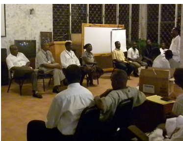
Haitian leaders discuss spiritual warfare