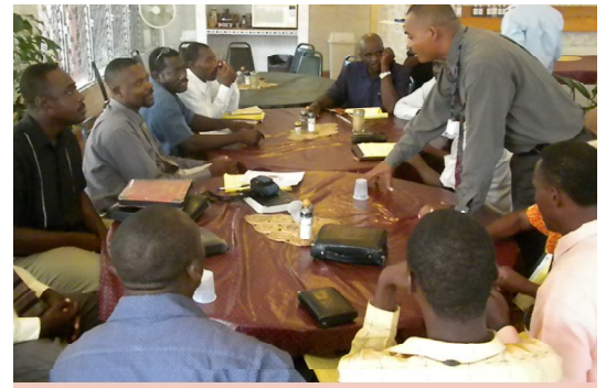
Haitian leaders discussing strategy for the year ahead

He saw men and women on fire for the revival of Haiti and ready to take the Gospel of Christ to the world.