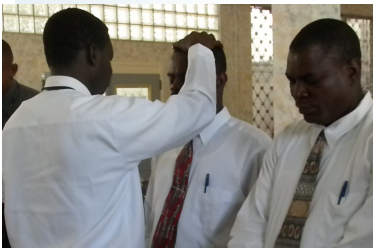
Haiti: A time of consecration

Participants were truly given skills to help (Continued on page 2)