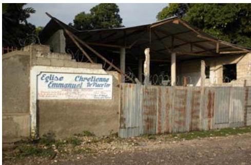
Emmanuel Church is both the church for the orphanage and the community. The walls and the roof render it unusable.

In Leogane, 90-95% of the buildings were destroyed; 20,000 of 50,000 people were killed or still missing. God's grace was on churches there. No funerals were held at the church on the orphanage. We have only heard of two children of one pastor that were killed even though everyone's house was destroyed.