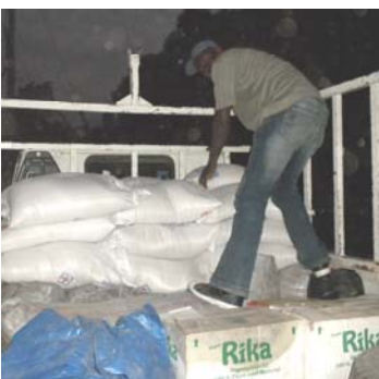
Rice, pasta and oil

This service that you perform is not only supplying the needs of God's people but is also overflowing in many expressions of thanks to God. Because of the service by which you have proved yourselves, men will praise God for the obedience that accompanies your confession of the gospel of Christ, and for your generosity in sharing with