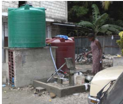
Water purification unit ready to be assembled

Sacks of rice, pasta (spaghetti is common for breakfast) and oil blessed your brothers and sisters in Haiti and showed that God had heard their prayers. Many of you gave not out of your excess, but sacrificially for those in Haiti. The inside pages are an attempt to