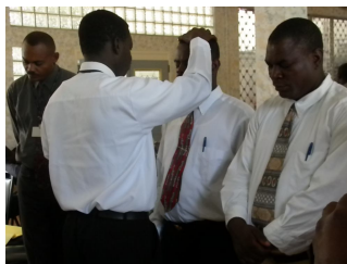
Haitian leaders commissioning regional prayer movement coordinators